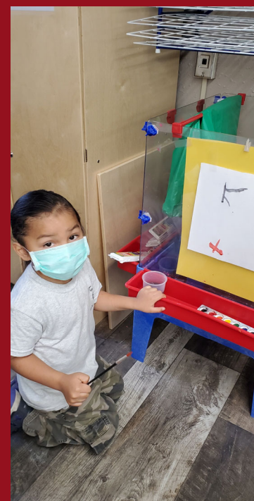
A student at Tate Topa Tribal School practices painting the letters of his name.

After you watch the prerecorded webinar here , be sure to provide feedback about the webinar at the survey link here . You have until Monday, December 7th, to complete the survey.